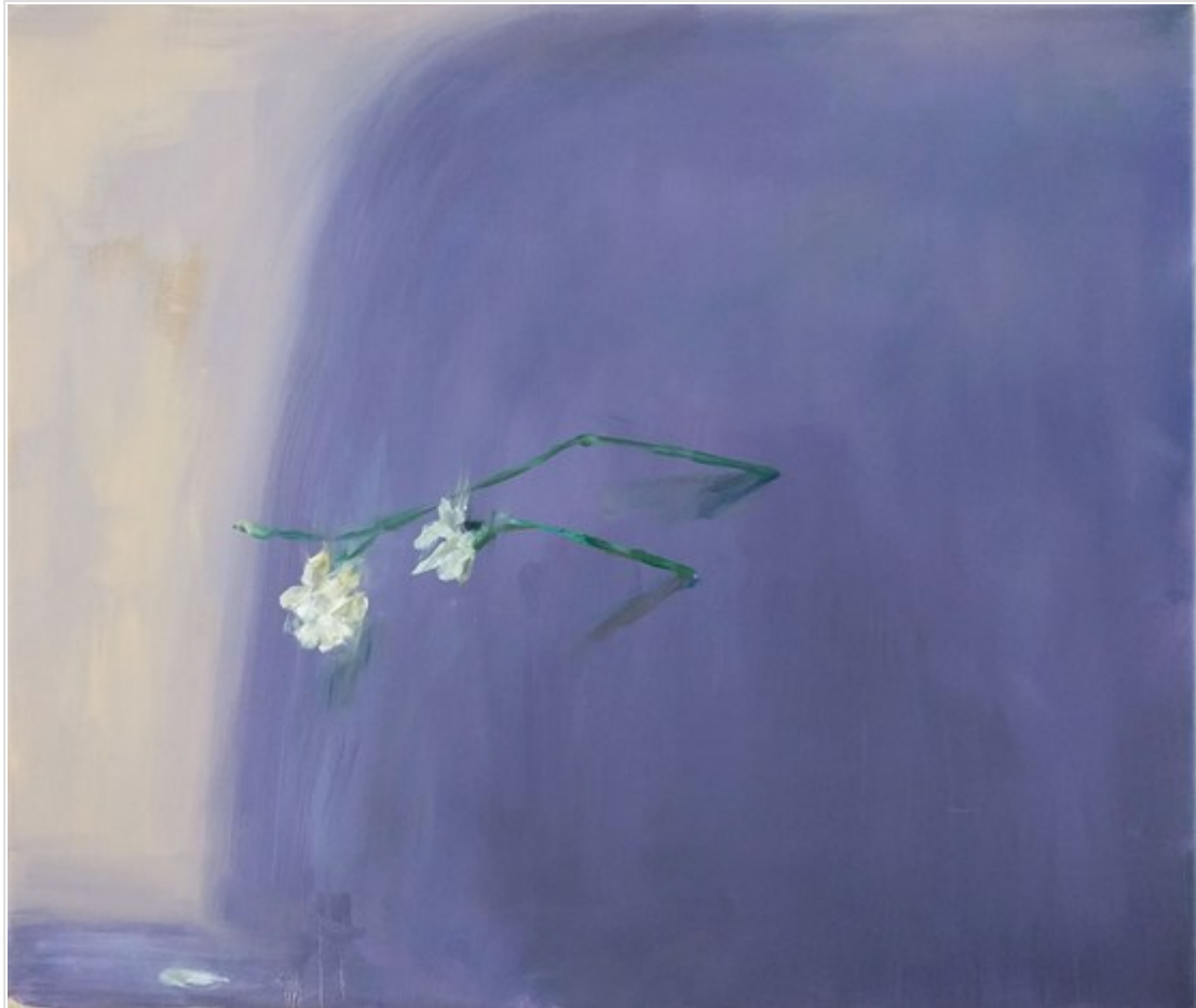
Falling - 2020, oil on canvas, 49 x 58 cm