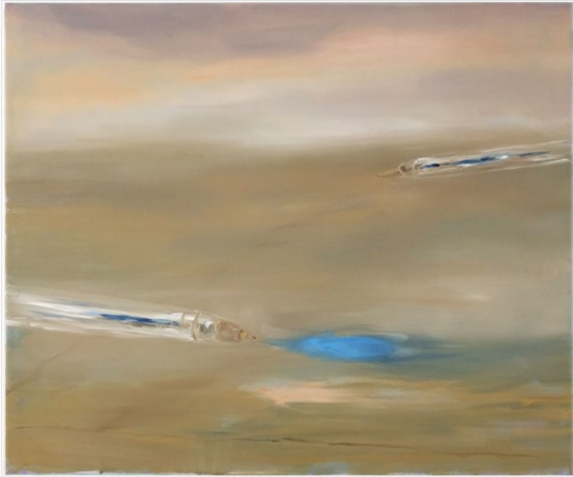
Bic Inkwell - 2020, oil on canvas, 50 x 60 cm

Recurring visual motifs are inanimate objects or materials, flora and fauna that has been anthropomorphized and displayed in a social construct or human context. These objects are often related to the act of making art itself: pencils and brushes, ink and paint, an empty canvas or paper, musical instruments. The result is a scene that might resonate with the viewer in multiple psychological ways. The paintings are not fixed stories: they do not confirm images, they create images together with the viewer.