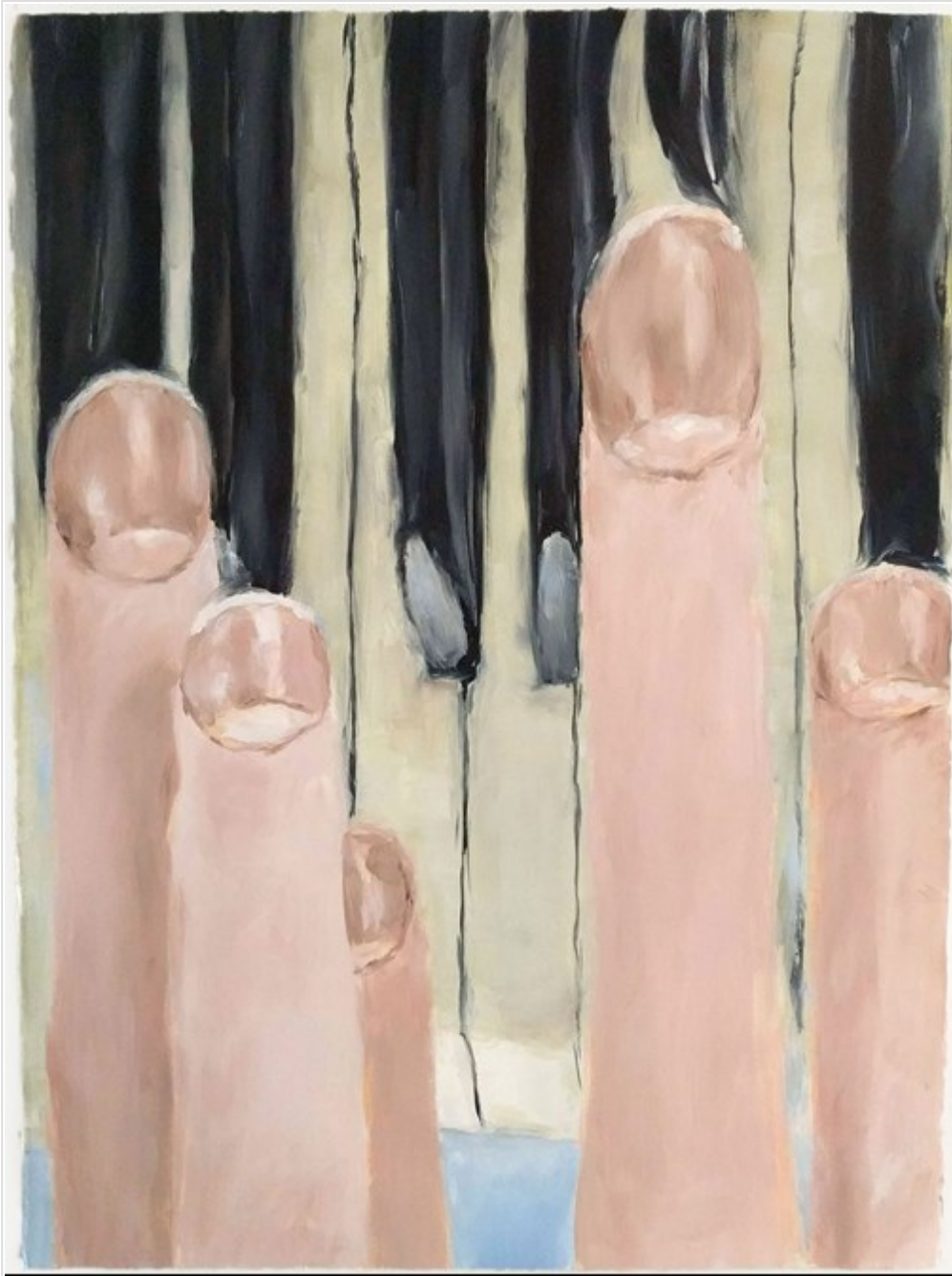
The Fugue II - oil on paper on canvas, 76 x 56.5 cm

On the positive side, this means having an extra focus and concentration on the work. This might ring true for a lot of other artists as well. I can imagine a lot of excellent work coming out of all these studios everywhere soon. Let's hope that by then there still is an artworld infrastructure to show and support the work.