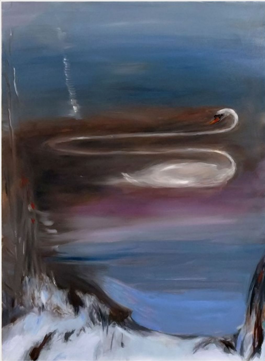
Swan II - 2019, oil on canvas, 90 x 66,5 cm

AD: How do you spend your time in this Corona period, and do you think it will affect your future work? Do you get anything positive out of this?