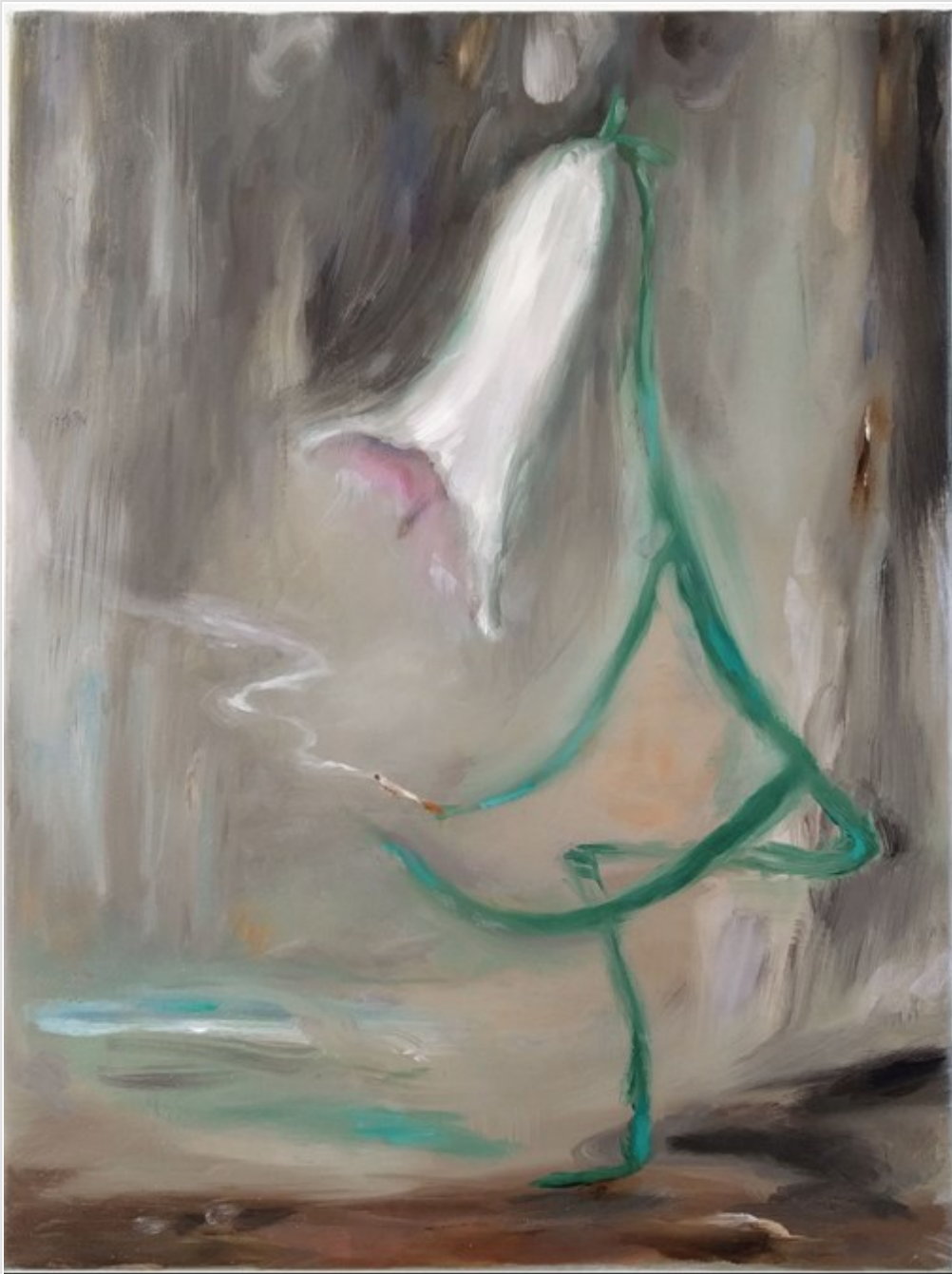
Just Being is Bewildering - oil on canvas, 40 x 30 cm

In 2010 the artist monography 'Curiously Human' was published. He is a Rijksakademie alumni, receiving a two year residency in 2006 & 2007 (Amsterdam).